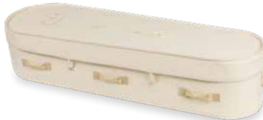
NATURAL LEGACY Woollen $2,992