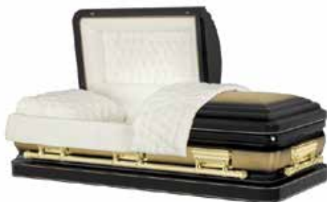
GOLDFIELDS 48 oz Bronze $19,250

Our range of metal caskets come in 18 gauge steel, 48 oz bronze and stainless steel.