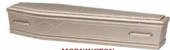
MORNINGTON Bronze $3,663