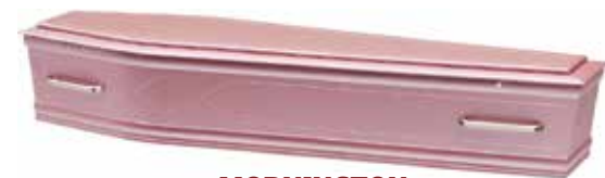
MORNINGTON Blush $3,663