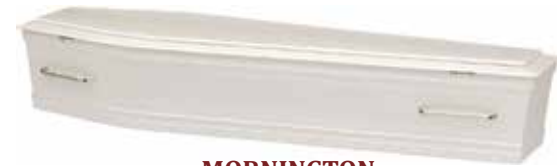
MORNINGTON Ivory $3,663

Our Mornington coffins are customwood coffins with a contemporary metallic, pearlescent finish.