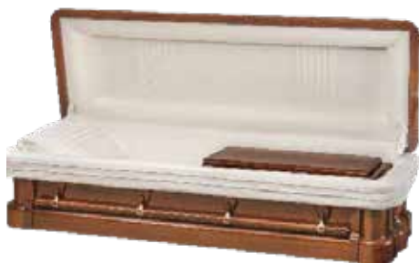
KOSCIUSZKO Mahogany $23,210