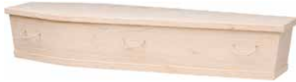
THE ECO Unstained Radiata Pine $2,882