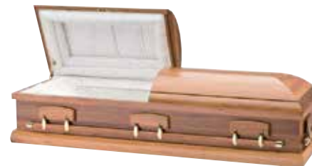
FRANKLIN Tasmanian Blackwood $9,174