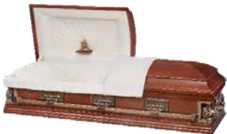
TAMAR Poplar $11,033