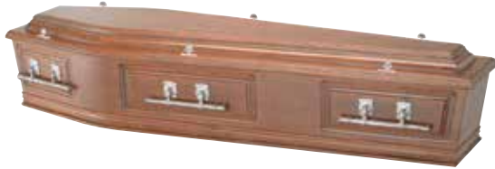
HOTHAM Radiata Pine $3,724

Our solid timber coffins come in a range of soft and hardwood timbers including Radiata Pine, Tasmanian Blackwood, Cedar and Oak.