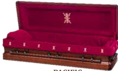
PACIFIC Mahogany $15,741

Our solid timber caskets come in a range of soft and hardwood timbers including Mahogany, Radiata Pine, Cedar, Maple, Poplar and Cherry.