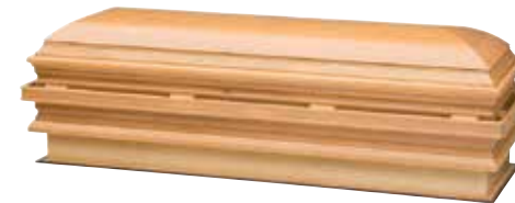
Capsule & Casket