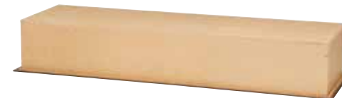
Particle Board - Inner Capsule