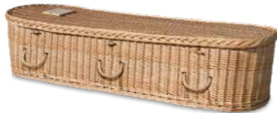
WILLOW Wicker $1,595