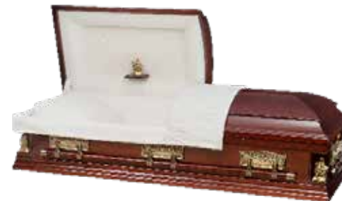
ALPINE Maple $12,595