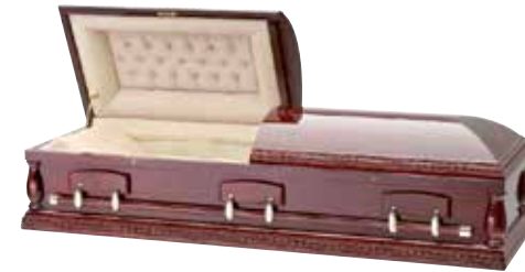
COONAWARRA Radiata Pine (Available in Rosewood – half couch as illustrated and Walnut – half couch and full couch) $8,558