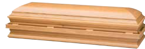
Solid Timber - Outer Shell