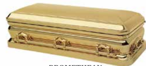
PROMETHEAN 48 oz Bronze $47,300