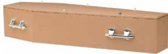
THE NATURAL Recycled Cardboard $1,617