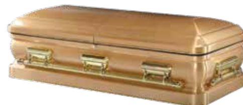
MAJESTIC GOLD 48 oz Bronze $47,300