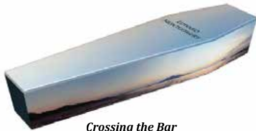
Crossing the Bar