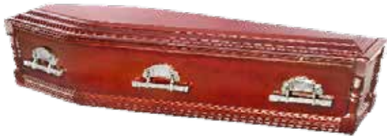
ESPERANCE Cedar $4,912