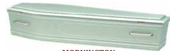
MORNINGTON Mint $3,663