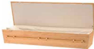
NORFOLK Radiata Pine $3,955