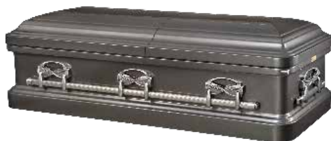
SORRENTO Shadow 18 Gauge Steel $8,415