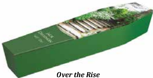
Over the Rise