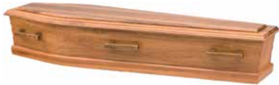
DERWENT Tasmanian Blackwood $4,549