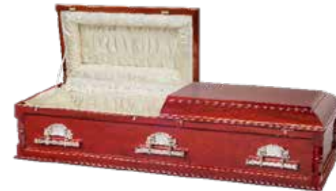
KIRRIBILLI Cedar $6,089