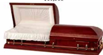
LINDENVALE Cedar $10,368