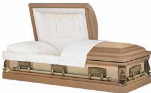
PYRENEES 18 Gauge Steel $10,285