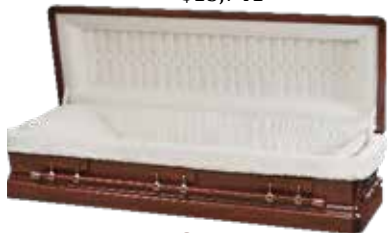
OTWAY Mahogany $15,741