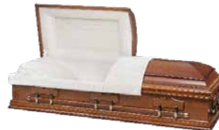
STRZELECKI Poplar $8,151