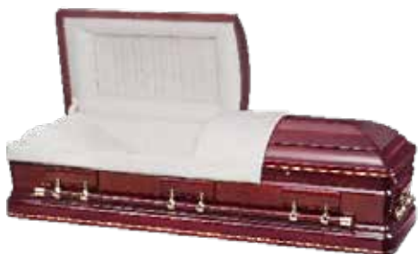
BARRINGTON Cherry $12,980