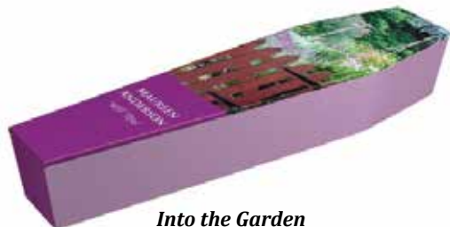
Into the Garden