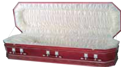
NEPEAN Radiata Pine (Available in Rosewood, Walnut and Ivory) $4,246