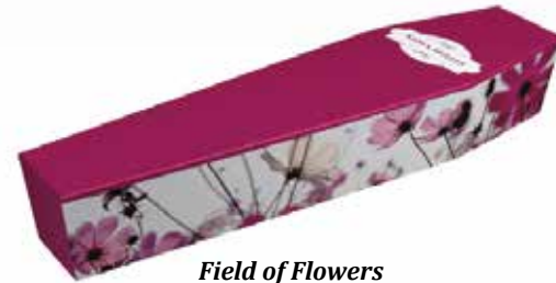
Field of Flowers