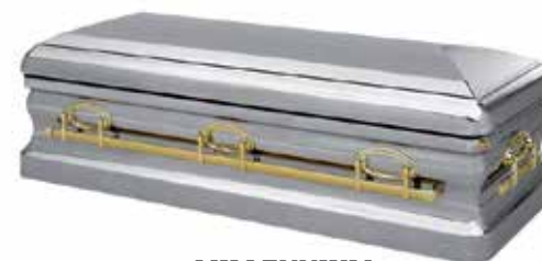
MILLENNIUM Stainless Steel $29,755