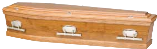
DAYLESFORD American Oak $5,539