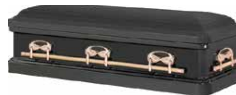
SORRENTO Midnight 18 Gauge Steel $8,415