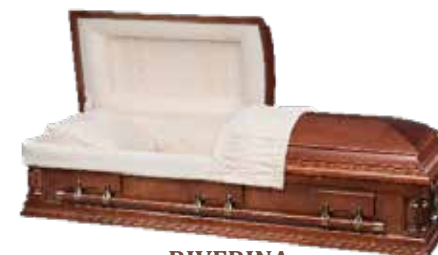
RIVERINA Poplar $10,368